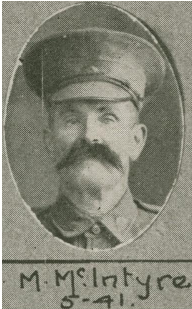
(The Queenslander Pictorial – 25 November, 1916)