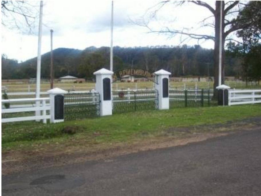
Urbenville Memorial Gates